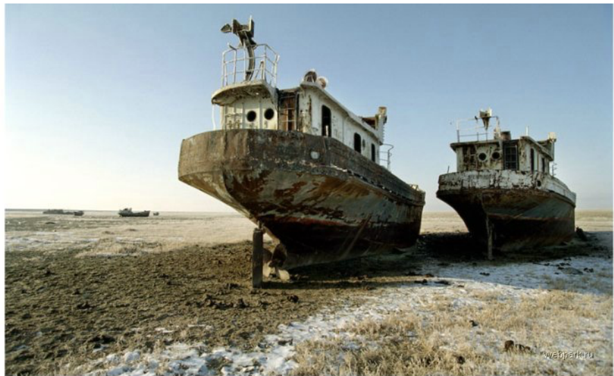
Former Aral Sea port of Dzhambul in Kazakhstan, the sea has massively shrunk due to overuse of water resources started by the Soviets

Changes in the flow of rivers in the Aral sea in Kazakhstan over the last 70 years have dried up a very large part of it. There are boats ‘high and dry’ - miles from any water and fish.